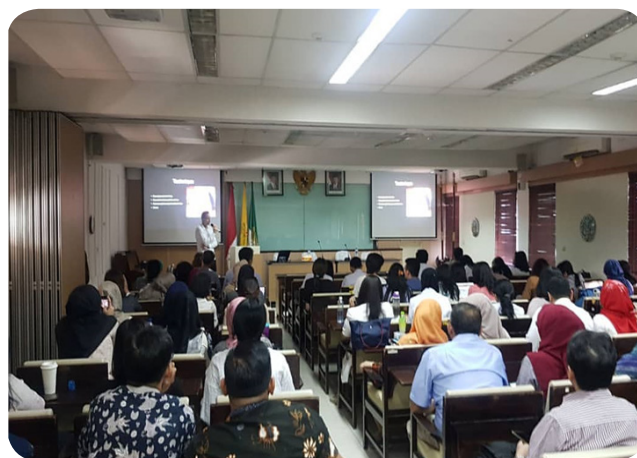
Presenting to the orthodontists and cleft surgeons in Jakarta