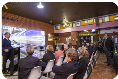
The Hon. Steven Marshall Premier of South Australia opens the Event.