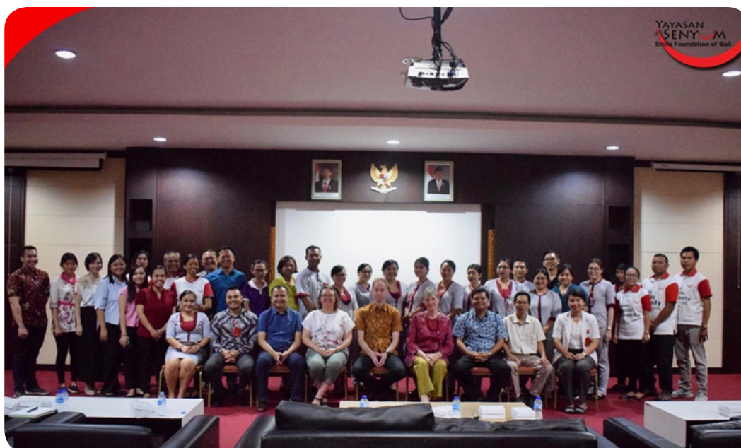
Right: Sharing Knowledge Seminar, Bali