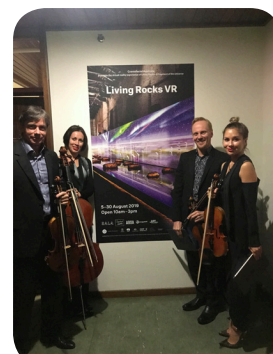
The Australian String Quartet